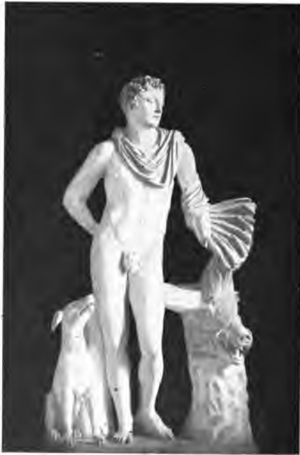
Fig. 77. Meleager.

mon, Theseus, from Athens, and his friend Pi rith'o us, Jason, later the leader of the Argo-nauts, Am phi a ra'us of Argos, and many other famous heroes. When the huntress At a lan'ta,